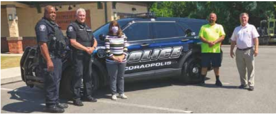
A $50,000 state grant awarded to Coraopolis police helped with the purchase of this vehicle.

This funding helps senior centers fund a variety of projects, such as updating and modernizing facilities, providing new health and entertainment programs, upgrading technology, and enhancing marketing opportunities.